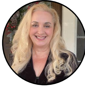
Cheryl Montoya Capacity Building Center for Tribes