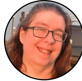
Marnee Evans Capacity Building Center for Tribes