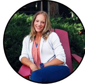
Sommer Purdom Capacity Building Center for Tribes