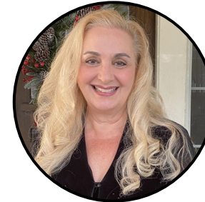
Cheryl Montoya Capacity Building Center for Tribes