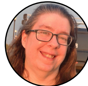
Marneena Evans Capacity Building Center for Tribes